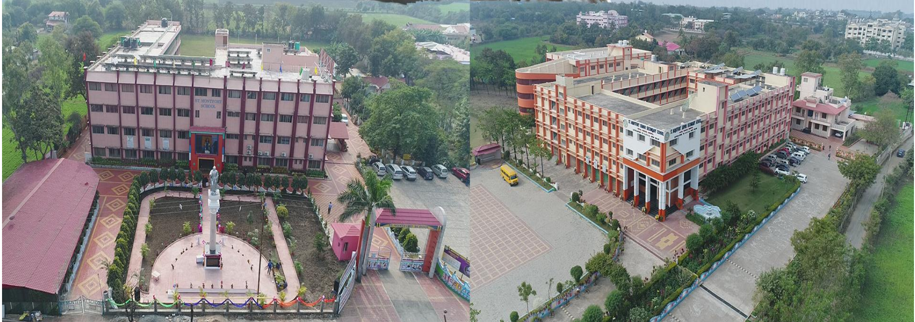
ST MONTFORT SR. SEC SCHOOL